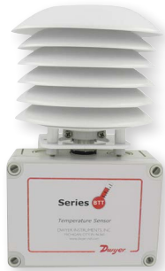
Outside Air with Radiation Shield