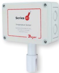
Outside Air without Radiation Shield