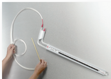
1227 Mounted in Incline Position