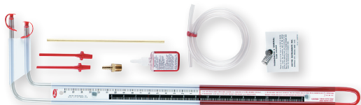
1227 Dual Range